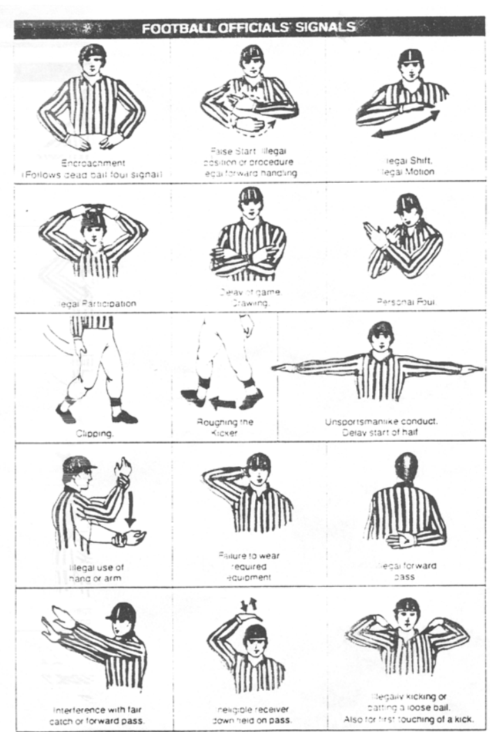
From Football Rulebook, The National Federation of State High School Assn's